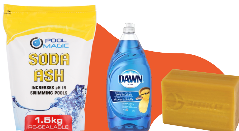
SODA ASH AND DISH SOAP

You can work on a stove top or with an electric grill