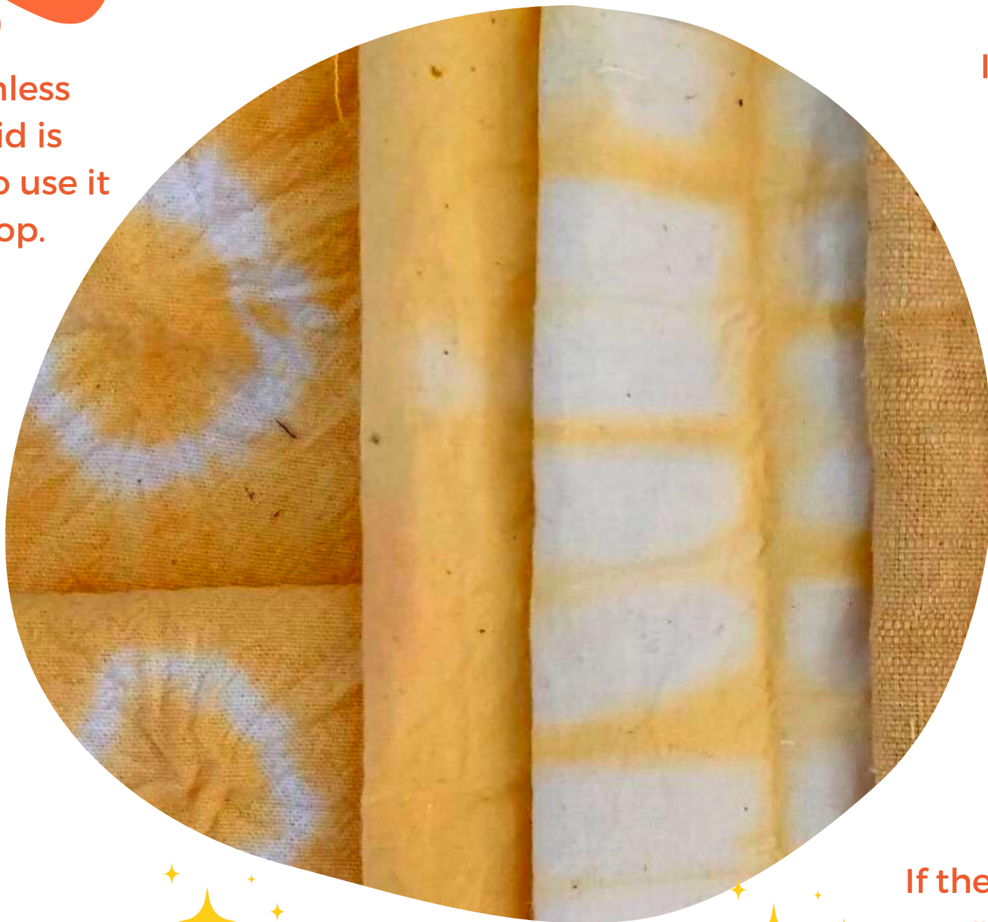
LOVE AND MAGIC

Gather some of the following: Marbles, stones, rubber bands, tongue depressors sticks, clothespins, small clams or thin cotton rope.