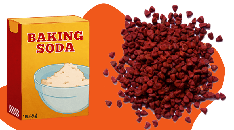
AXIOTE (ANNATTO) SEEDS

We will need it to scour the fabric, you could also use any natural soap without fragrance or color